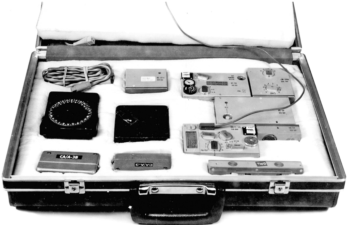
Complete fully transistorised agents station RS-59 packed in a suitcase. This particular suitcase was captured in the GDR in possession of an American agent.